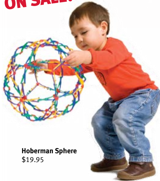
Hoberman Sphere $19.95