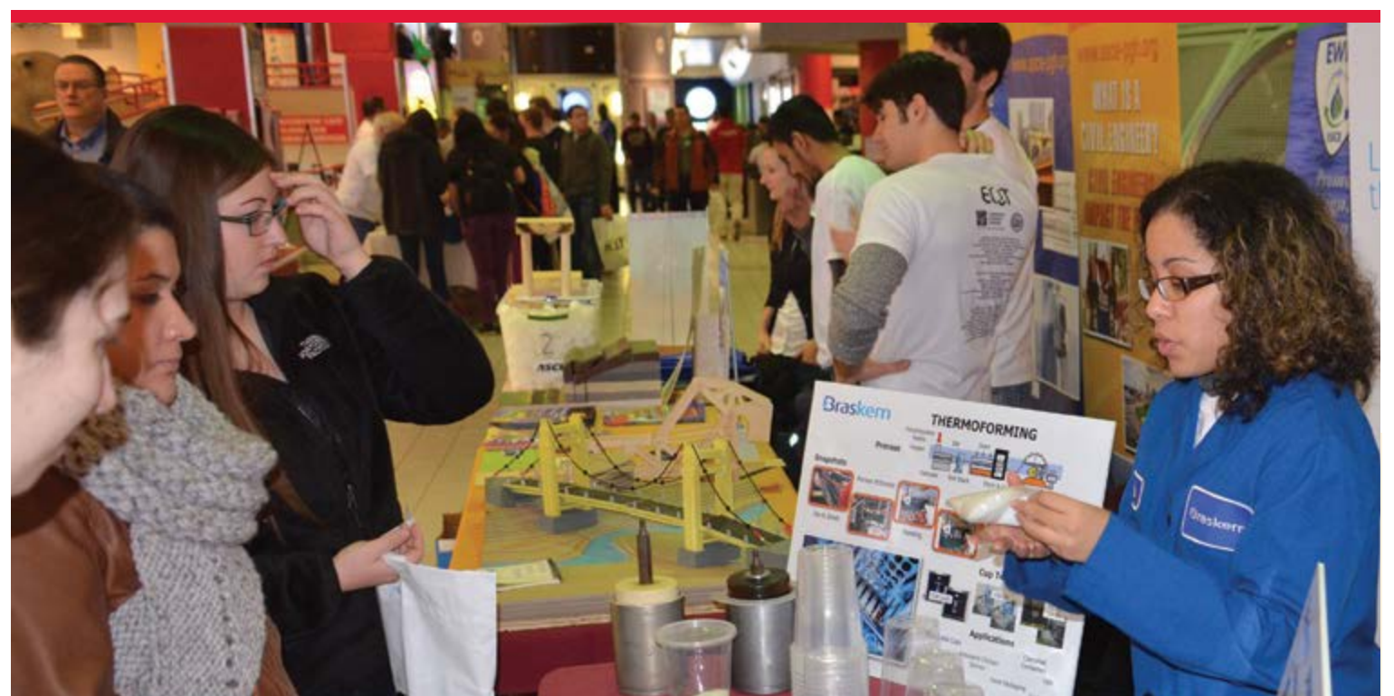
Students\ interact\ with\ employees\ of\ petrochemical\ company\ Braskem\ during\ Engineer\ the\ Future.