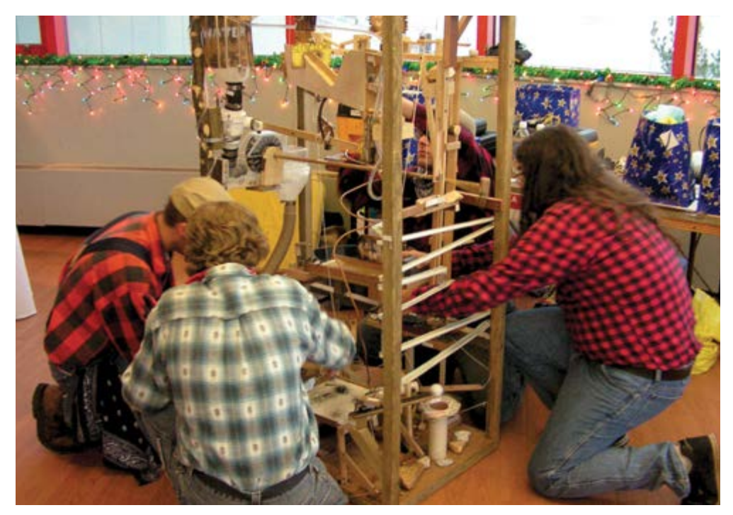
Students carefully test and tweak their Chain Reaction Contraption apparatus at Carnegie Science Center.