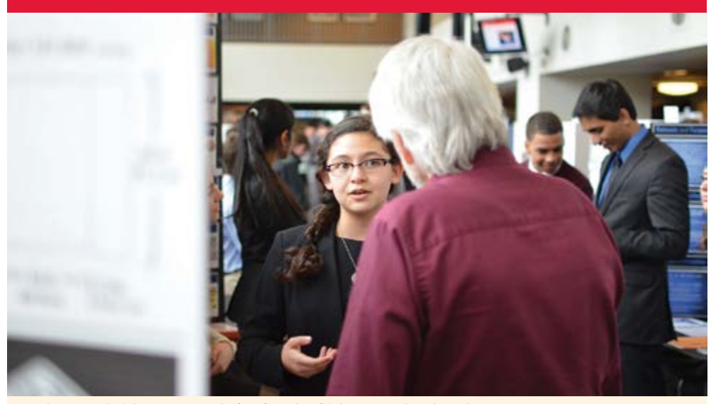
During Carnegie Science Center's Pittsburgh Regional Science & Engineering Fair, a student presents her science fair research to a judge.

The oldest kids who participated in the first year of Carnegie Science Center's science fair would be turning 92 this year, as the Pittsburgh Regional Science & Engineering Fair (PRSEF) marks its 75th anniversary.