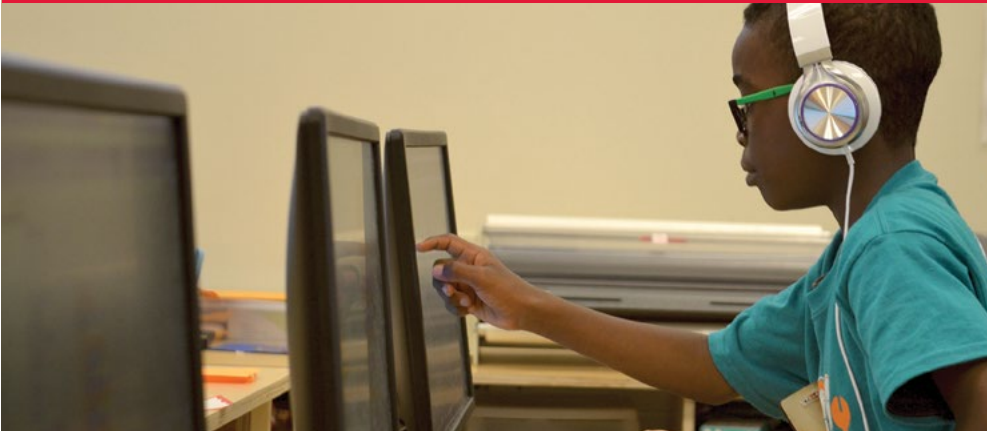
Kids learn digital design and coding at Videogame Arcade summer camp.

Deep in concentration with headphones on their ears and fingers on their keyboards, a roomful of 10–12-year-olds in Fab Lab Carnegie Science Center build their very own video games.