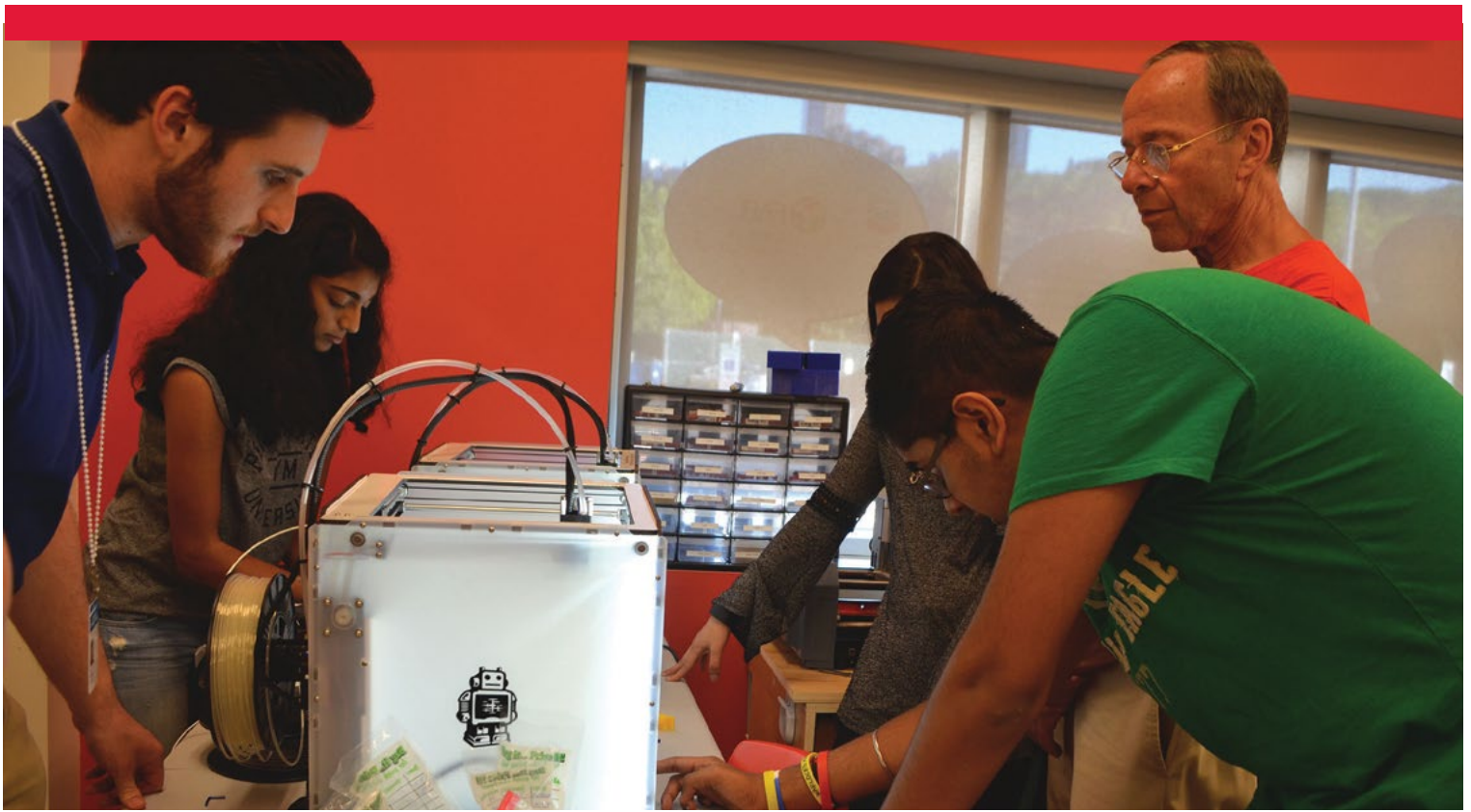
Fab Lab participants work with Fab Lab leaders to learn how 3D printing works.