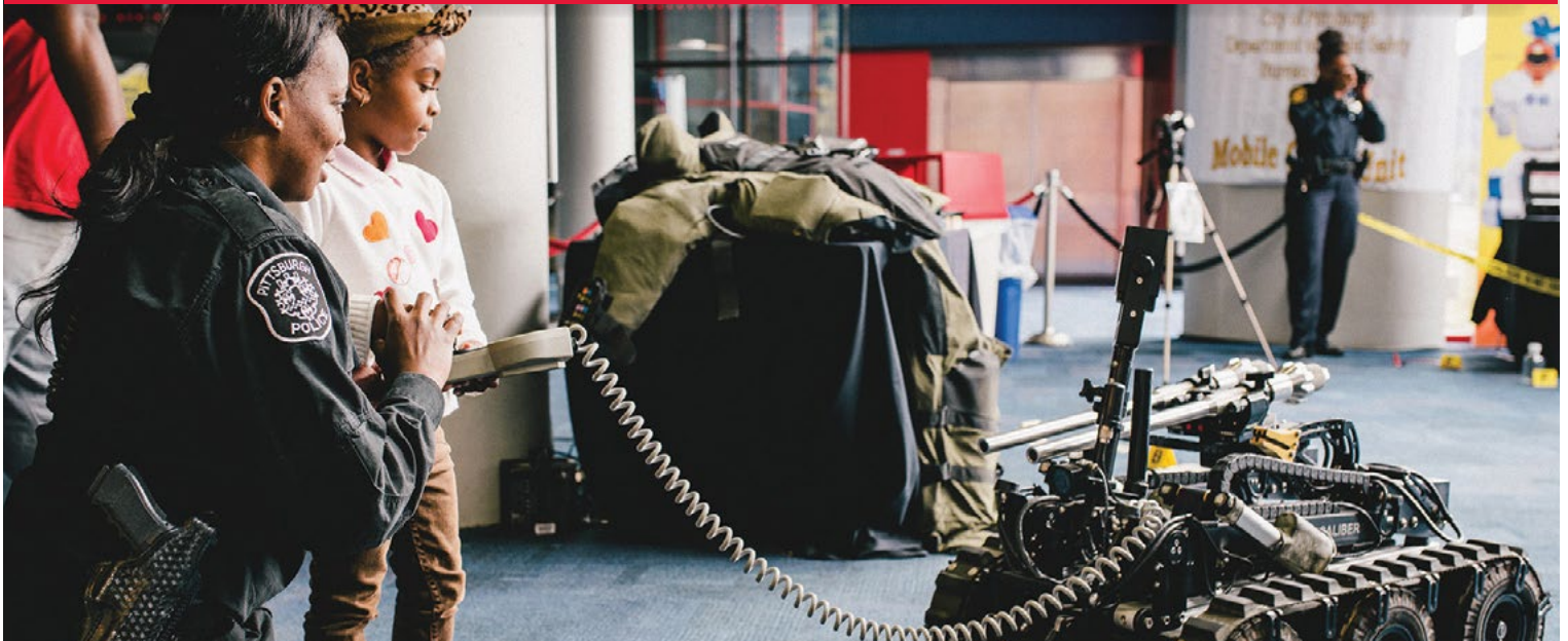
During Girls Rock Science Weekend at Carnegie Science Center, a representative from the Pittsburgh Police Department explains how bomb detection equipment works.