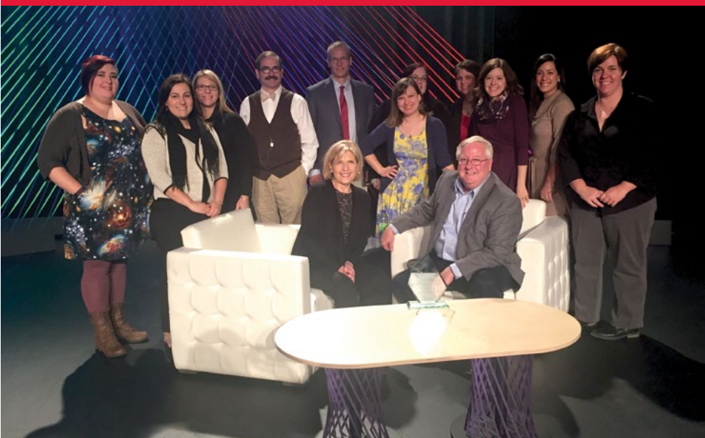
Carnegie Science Center staff proudly pose with their "Edgie Award" at the Association of Science-Technology Centers conference in Montreal.

The Carnegie STEM Excellence Pathway continues to grow, and it's now helping more than 7,000 schools in 17 states improve their STEM education practices for 3.9 million students. In recognition of the Pathway, the Association of Science-Technology Centers (ASTC) awarded Carnegie Science Center the Roy L. Shafer Leading Edge Award for Business Practice. Staff accepted the award at the annual ASTC Conference in Montreal.