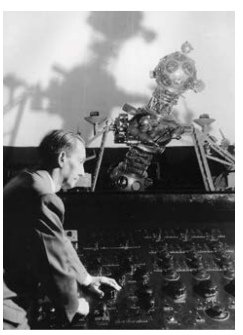
The Zeiss projector used 1,000 watt lamp to project the stars. Today, it's displayed at Carnegie Science Center.

The Buhl Planetarium became the Buhl Science Center and a component of Carnegie Museums of Pittsburgh years later. In October 1991, The Henry Buhl, Jr. Planetarium & Observatory opened in the newly established Carnegie Science Center.