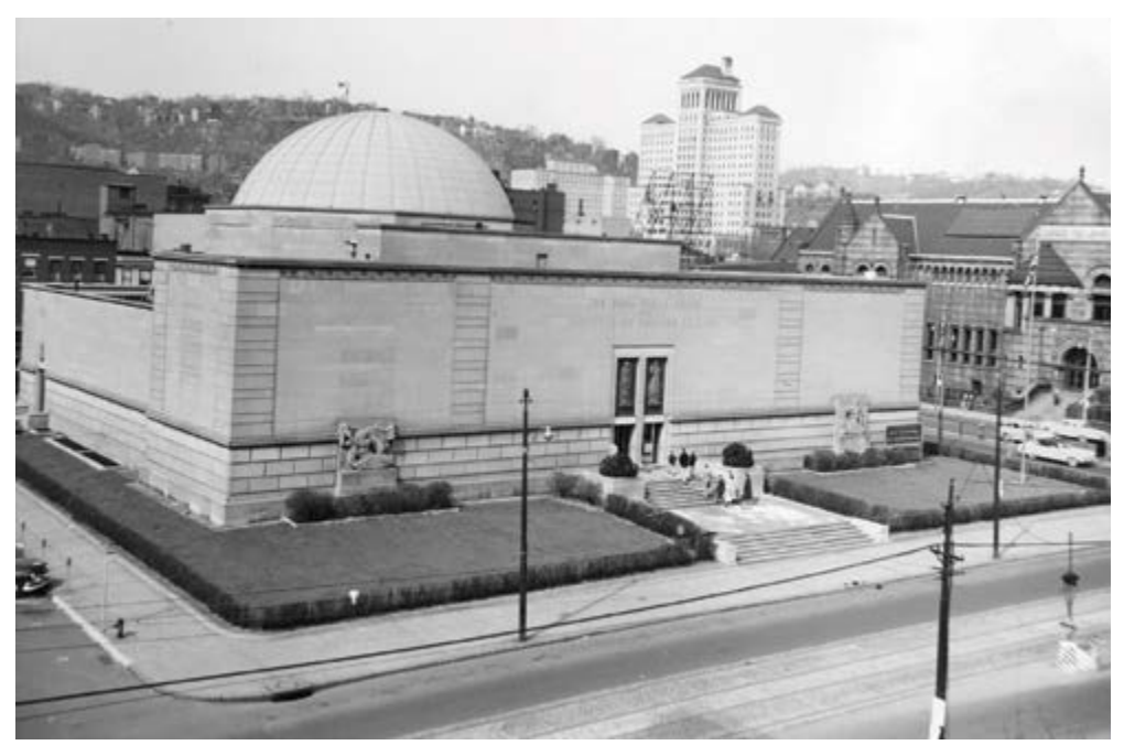
The original Buhl Planetarium on Pittsburah's North Side.