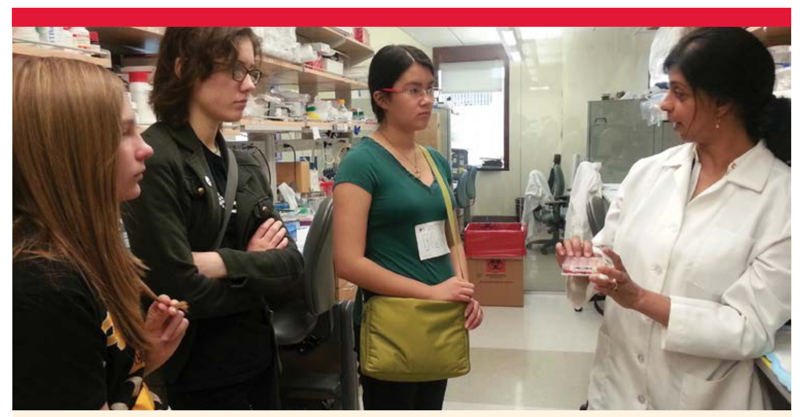
During a visit to the Vascular Institute, girls explore medical careers.