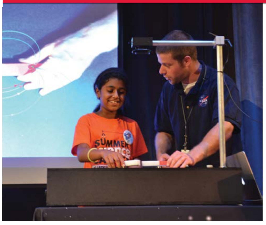
A demonstration during Carnegie Science Center's "SolarQuest: Living with our Star" explains magnetic field lines and how they relate to auroras.

One of the four Carnegie Museums of Pittsburgh