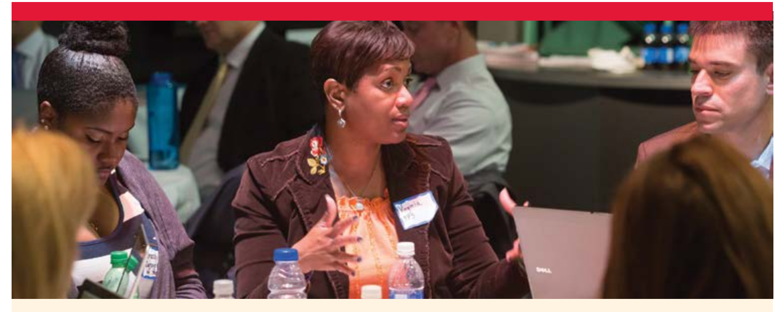
STEM Excellence Pathway partners meet at Carnegie Science Center in October for a workshop.